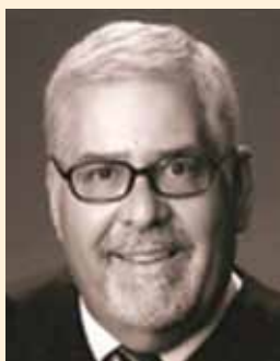
The Hon. A. Joseph Alarid

(CANON 5) 4 MEMBERS ELECTED BY CONVENTION FOR 2 YEAR TERMS; 2 TERM LIMIT; 1 CLERGY; 1 LAY PERSON ELECTED EACH YEAR.