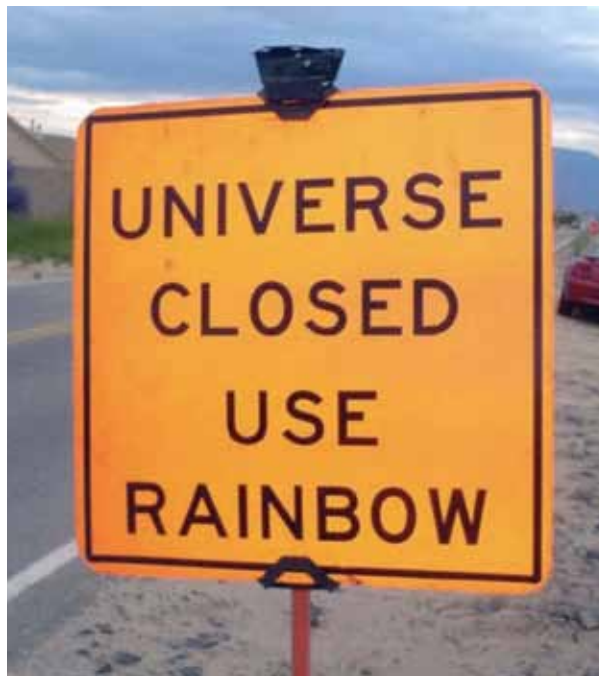
"The world is a little bit different here in the land of enchantment," was the comment on this photo taken recently in Rio Rancho.