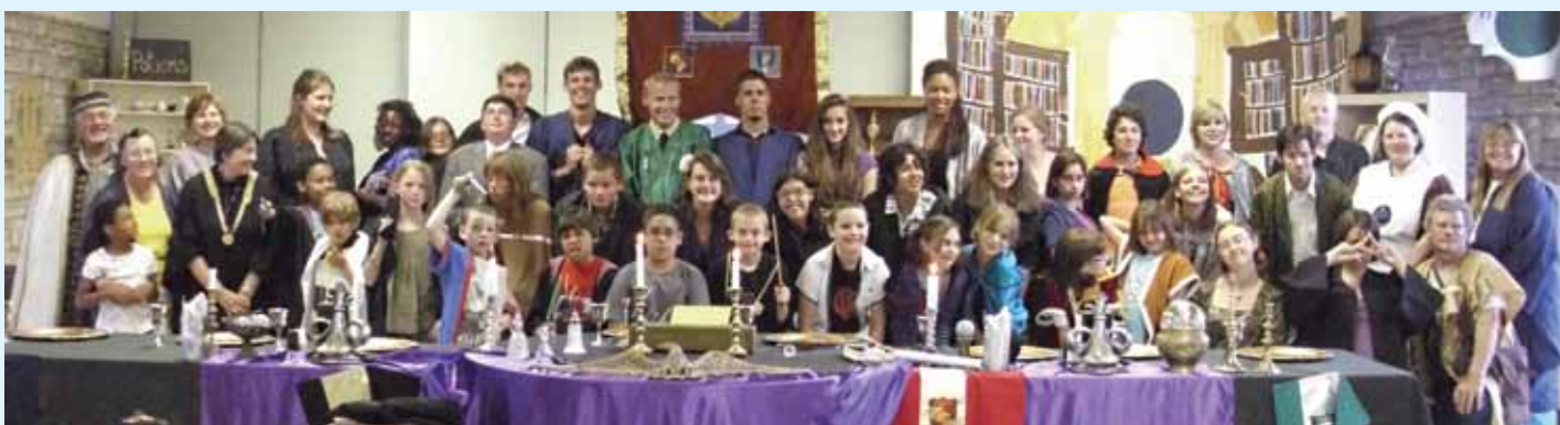
Harry Potter Camp participants take their places for the group photograph at the Gathering Hall converted into the Dining Hall of Hogwarts.